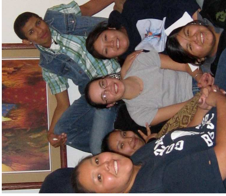
Serving Native Youth on the Yakama Indian Reservation